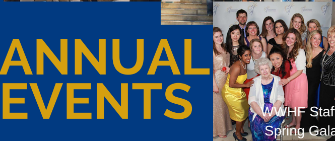
WWHF Staff, Spring Gala